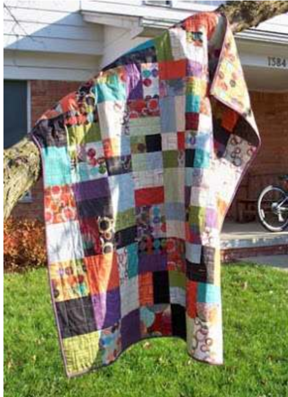
Basic Math Quilt

I've been a big fan of Brigitte Heitland's work since I first stumbled across it. I was thrilled to see her first fabric line, Juggling Summer, and I just love the great colors and prints. The sort of distressed-looking prints pair so well with the log-cabin inspired prints and the fantastic blenders. And the colors are the perfect shades of green, purple, orange and turquoise along with black, grey and cream. I had to have it!