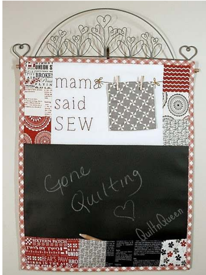
Charmed Message Board