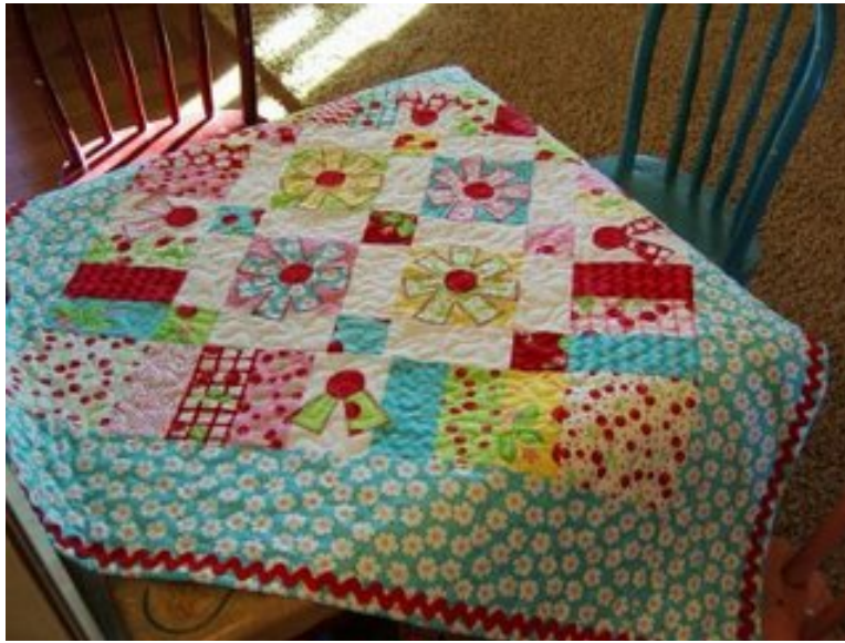
Cherries and Blossoms Table Topper by Sheri Howard