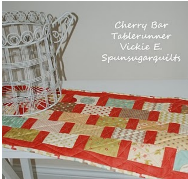
Cherry Bar Table runner by Vickie Eapen