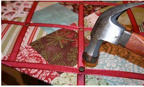
Last Step: Nail the Tacks