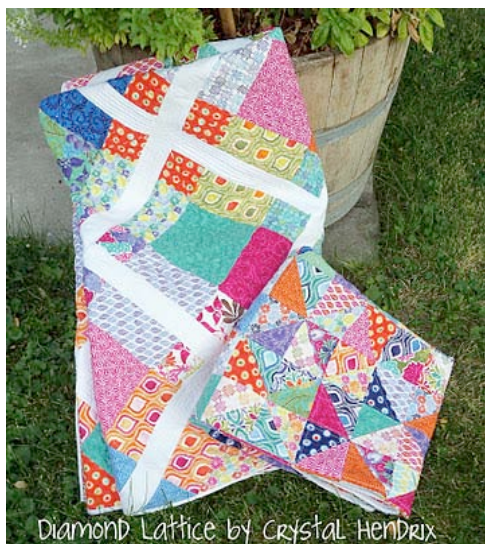
Diamond Lattice by Crystal Hendrix

Diamond Extras, approximately 53" x 46". This beautiful bright quilt mimics the Diamond Lattice quilt. I can't decide which quilt I like best!