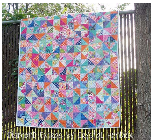
Diamond Extras by Crystal Hendrix

Diamond Lattice Quilt, approximately 70" x 80". It's a very beautiful and bright quilt! Would make a beautiful quilt to put over the couch to bring some color to the room, or to use as a nice full sized bedspread.