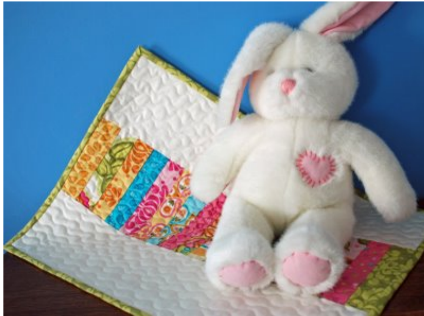
Doll Quilt by Vickie Eapen 13" x 19"