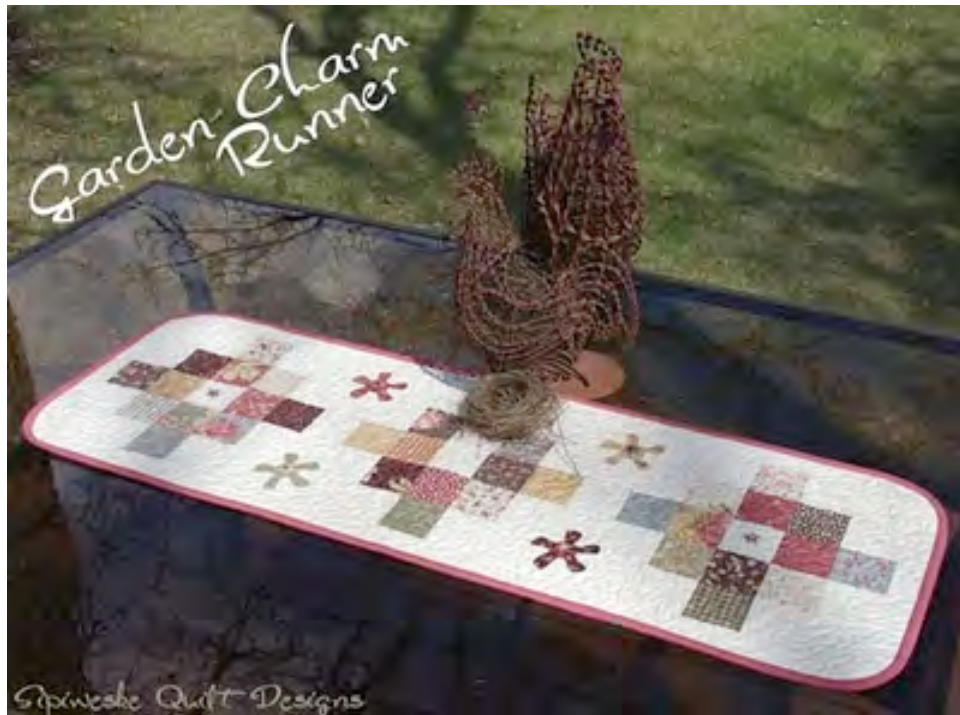
Garden Charm Table Runner by Marlene Biles