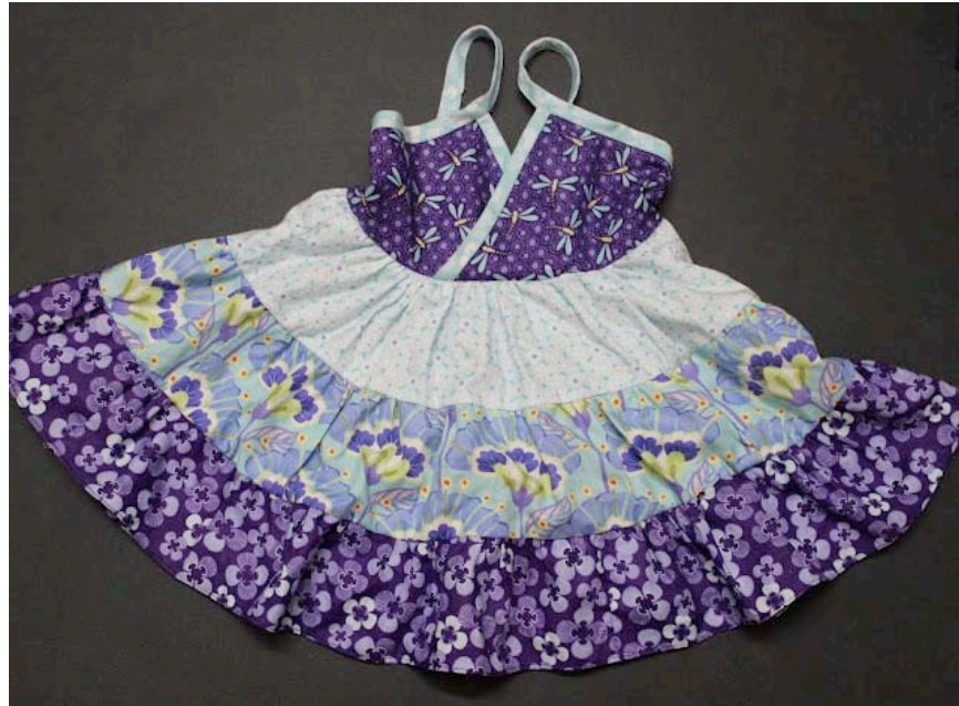
Lucky Layers Tiered Dress Size 2T by Anshu Jain