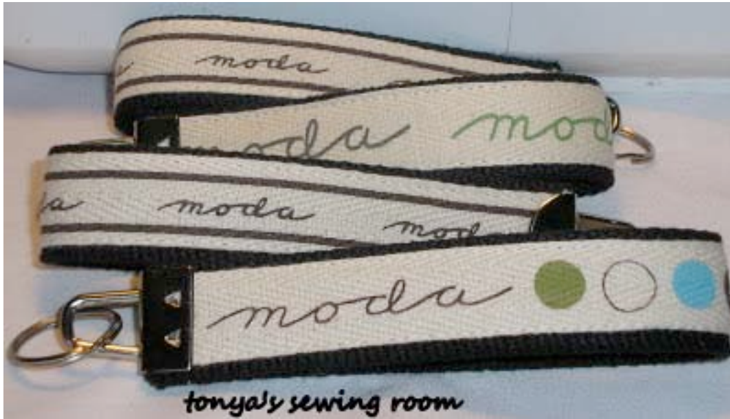
Moda Twill Tape Key Fob by Tonya May

Hi, I'm Tonya from Tonya's Sewing Room {tonyassewingroom.blogspot.com}. Today I'm going to show you how to make a Moda Twill Tape Key Fob from all those precut Twill Tape's you've been saving.