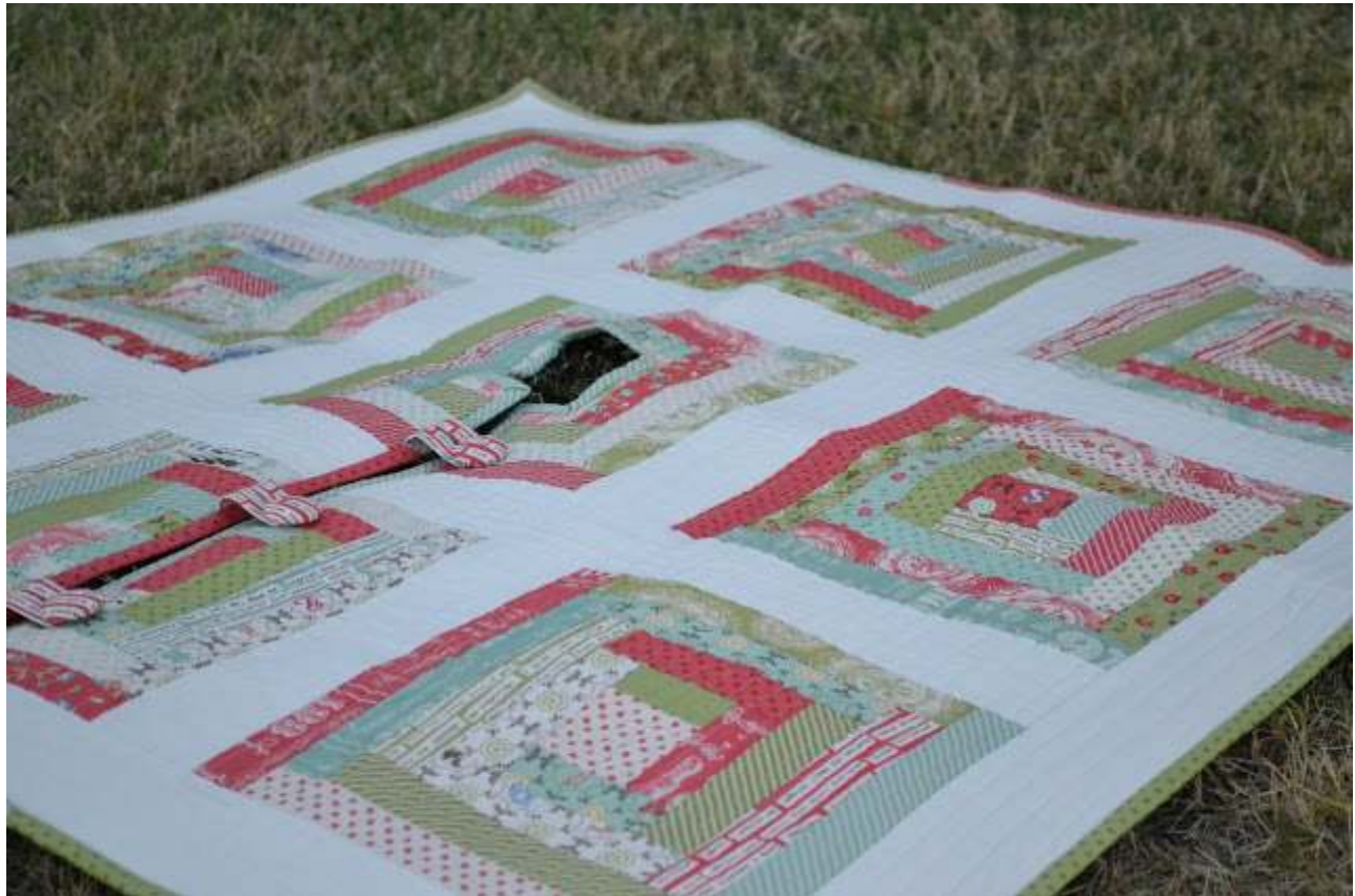
Modern Log Cabin Tree Skirt