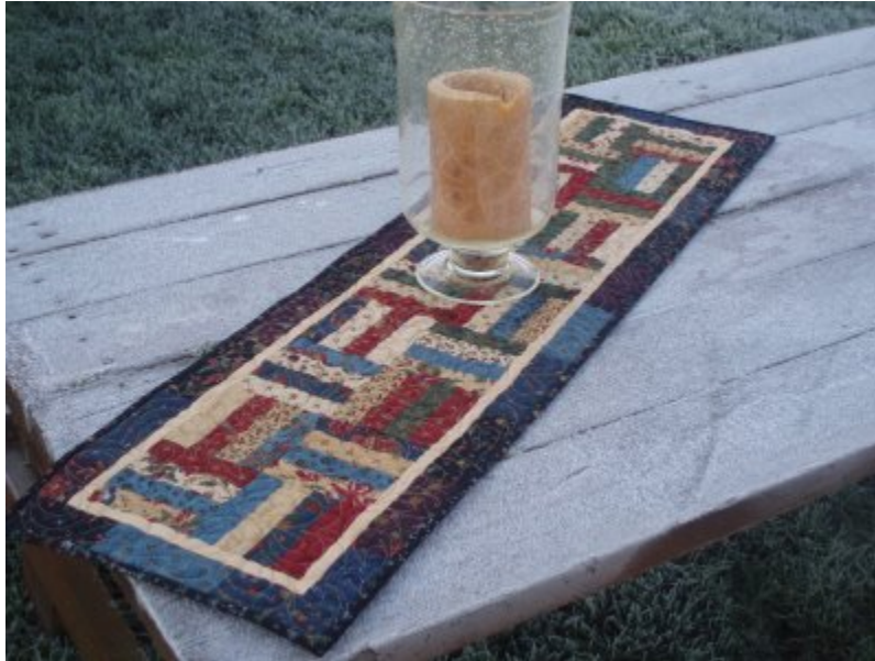
Petits Fours by Angie Davy

Petit four (plural: petits fours): a tiny, bite-sized cake with delicate layers of moist cake filled with smooth butter cream and jam fillings. Each cake measures approximately 1.5 " x 1". The miniature cake is often dipped in fondant and decorated with piped icing flowers. The name is from the French petit four, meaning "small oven".