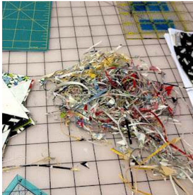
This is what I trimmed off of my blocks.

Trim to 4 1/2 inches square. Really, i am totally serious. Do this step! It doesn't look like much, but every little bit adds up. I use my ruler that has a big "x" on it. Aline the seams with the lines of the "x" to make sure that the block is squared correctly. It will help your pinwheel points meet in the center when you finally put all of the blocks together.