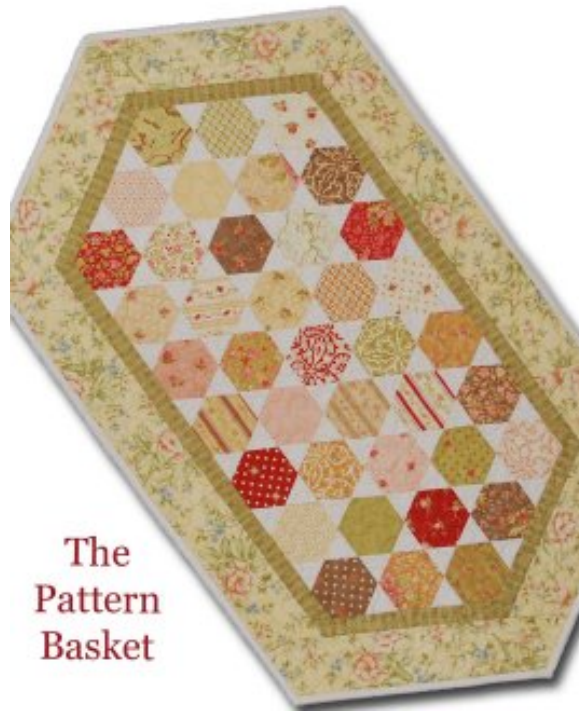
The Pattern Basket