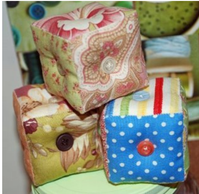
Sugar Cube Pincushion by Vickie Eapen