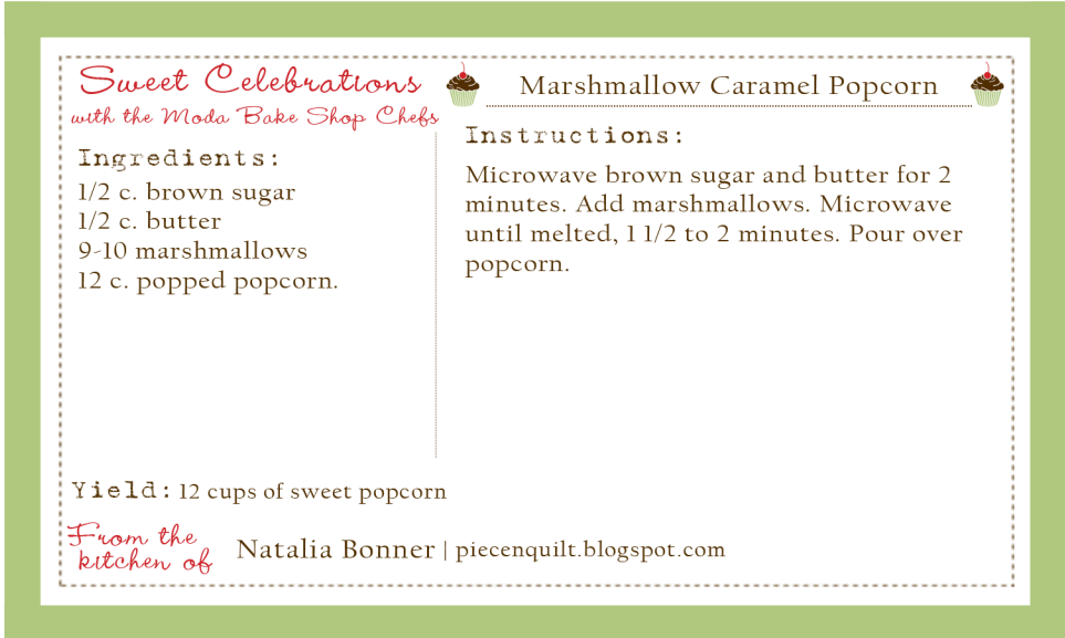
3"x5" recipe card