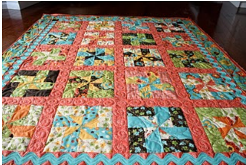
Quilt as you like....

From the border fabric, cut 5 strips, 4.5 inches wide. Trim 2 strips to 4.5 inches by 38.5 inches. Attach to the top and bottom of quilt top. Sew the remaining 3 strips together. From this super long strip, cut TWO strips measuring 4.5 inches by 60 inches. Attach these two border strips to the left and right sides of the quilt top. Your quilt should finish at 50 inches by 60 inches.