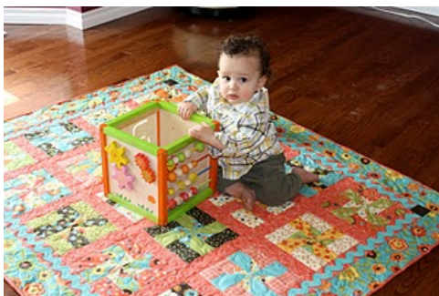
and add a baby to complete!

Bradie Sparrow http://quiltcetera.wordpress.com/ http://www.quiltcetera.com/