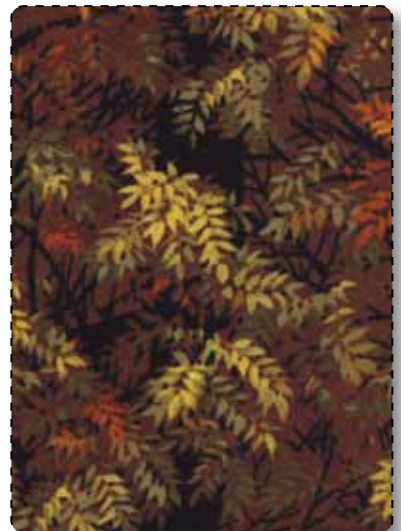
32663 12 Brown