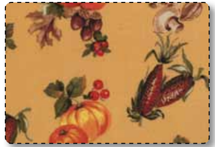
32664 13 Gold