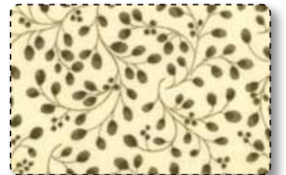
32667 18 Tan