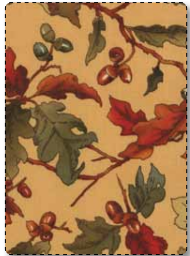
32662 13 Gold