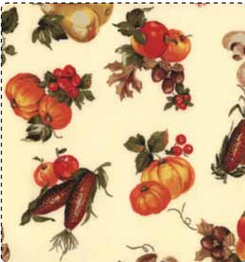
32664 12* Tan