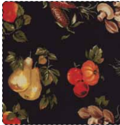
32664 17 Black