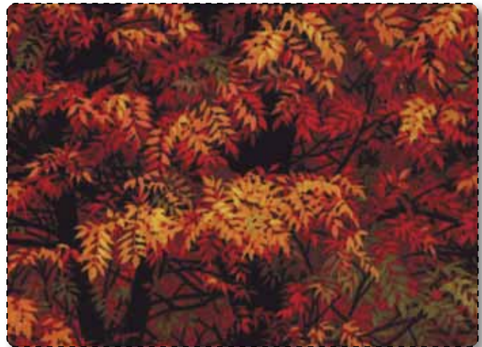
32663 11* Black