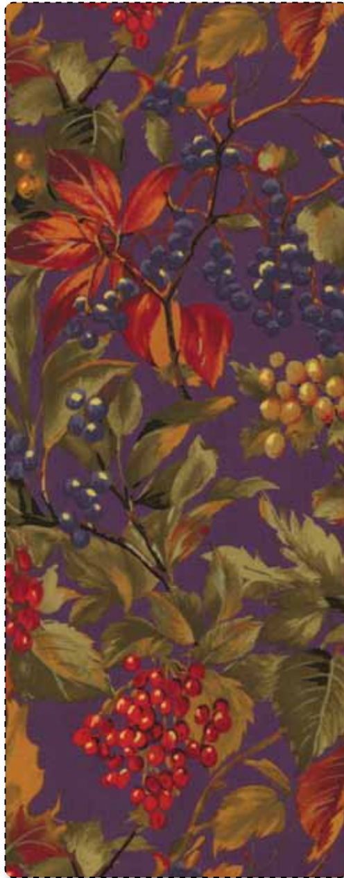
32660 15 Purple

Berry-laden branches with pops of plum and rich red jewel the festive fall landscape while acorns scatter the sidewalks. This new collection is a cornucopia of classic autumn imagery, sure to add warmth to a chilly fall day.