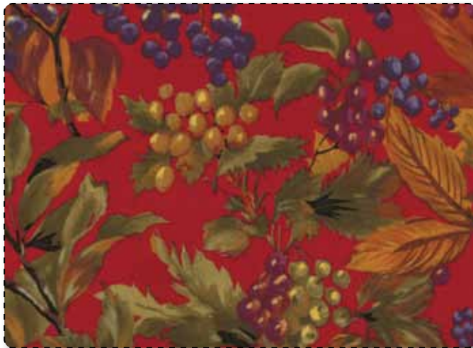
32660 16* Crimson