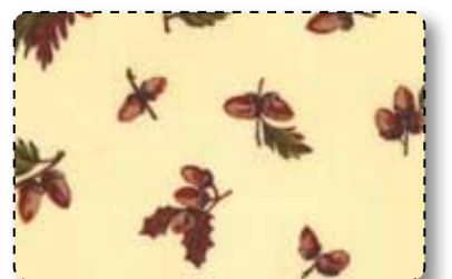
32665 12 Tan