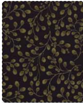
32667 23* Black