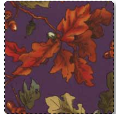
32662 15* Purple