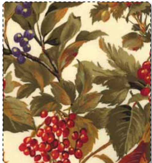
32660 12* Tan