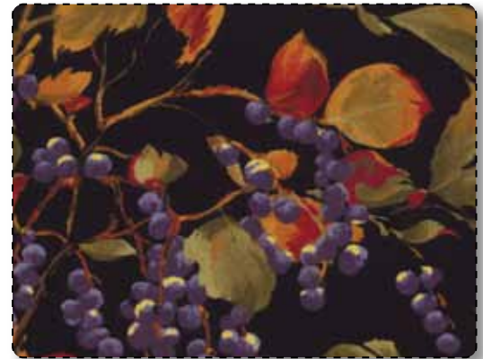
32660 17* Black