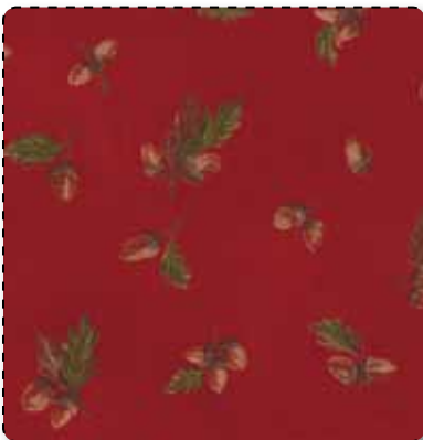
32665 16 Crimson