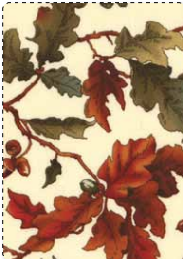
32662 12 Tan