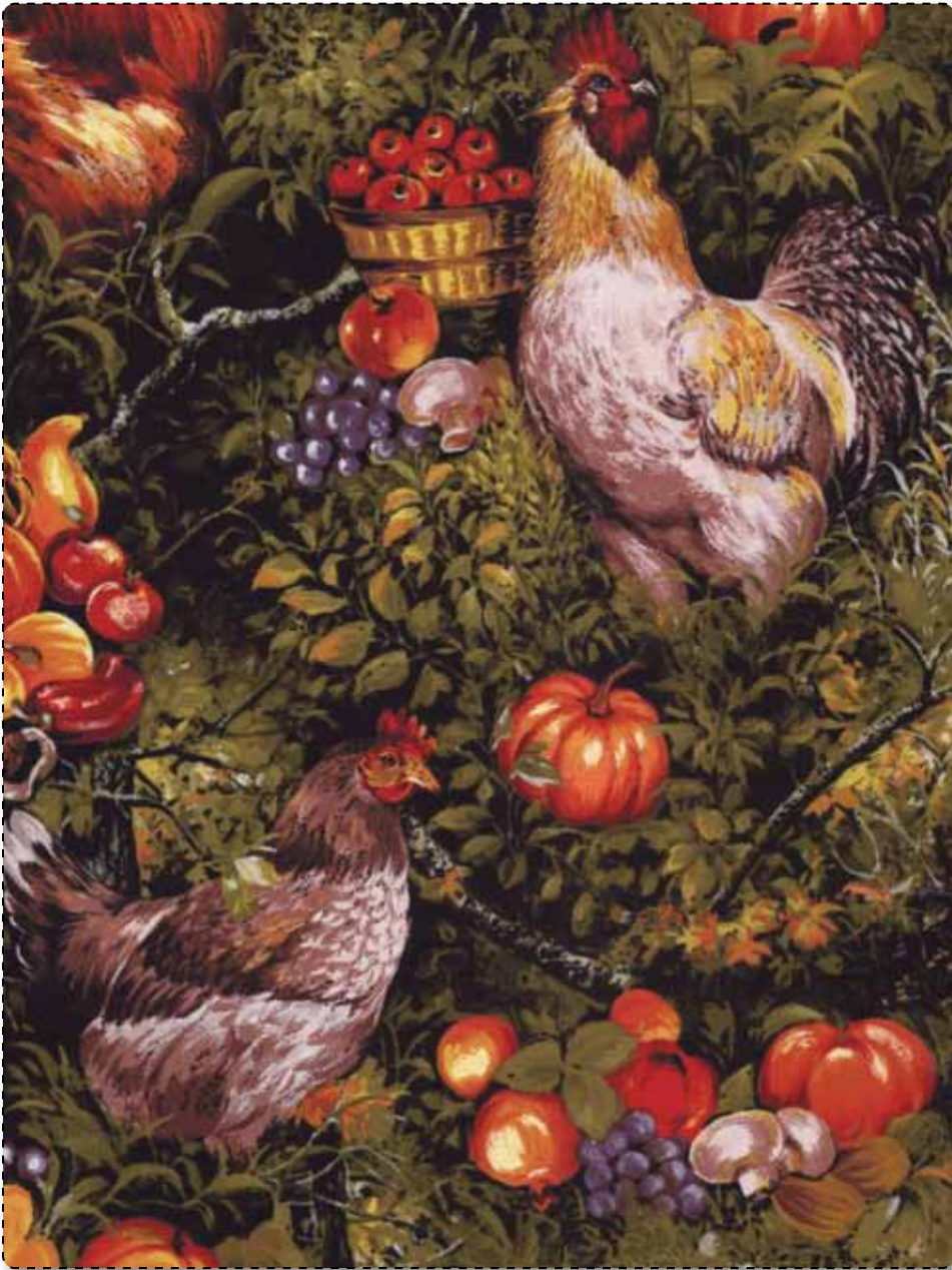
32661 12* Multi