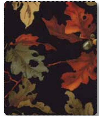
32662 17* Black