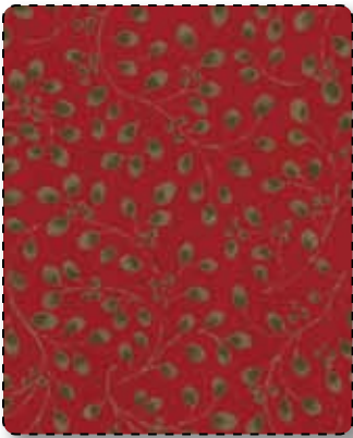
32667 22* Crimson