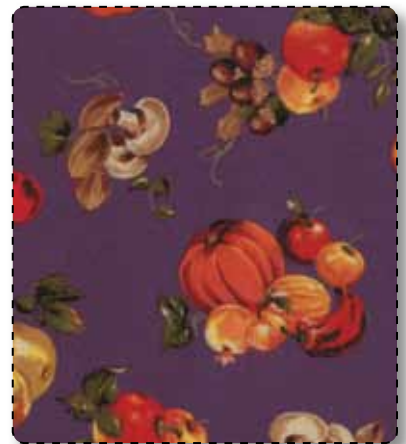
32664 15* Purple