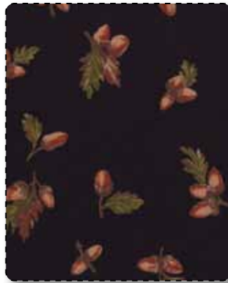
32665 17 Black