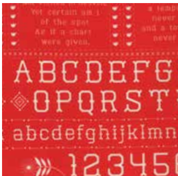
*37061 12 Scarlet