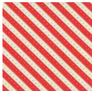
*37065 22 Scarlet