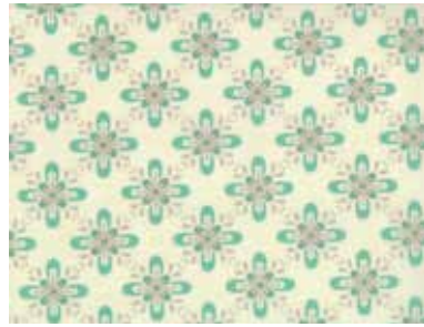
37063 21 Cream Aqua