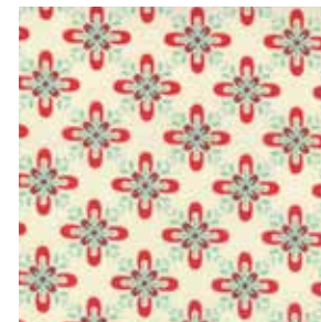
*37063 11 Cream Scarlet