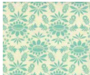
37062 21 Aqua