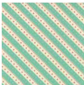
*37065 11 Aqua

Fabrics with * included in low cal assortment