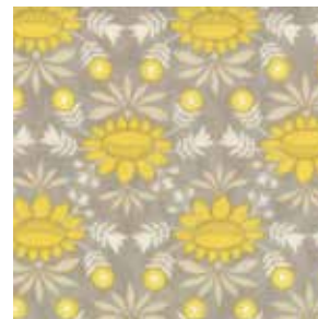
*37062 15 Grey