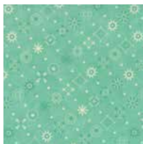
*37064 13 Aqua