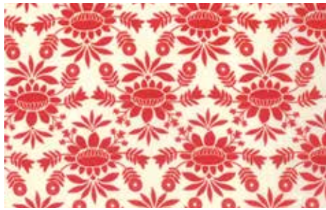
37062 22 Scarlet

Bella Solids are not included in the Assortments or Precuts.