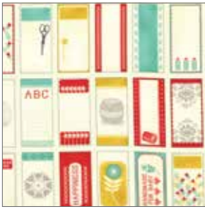
37060 11 Cream