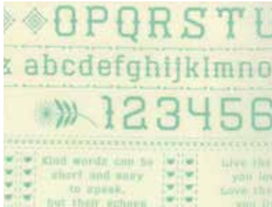
37061 21 Cream Aqua