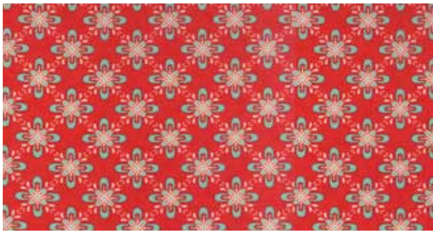
37063 12 Scarlet