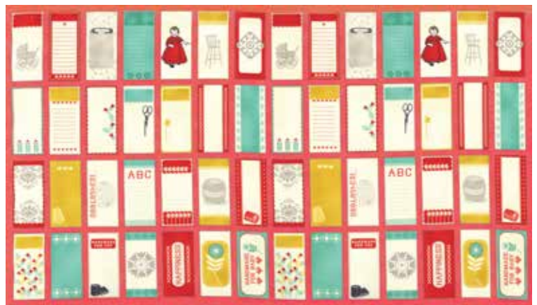
37060 12 Scarlet