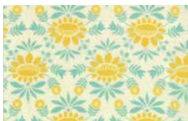
*37062 23 Aqua Mustard