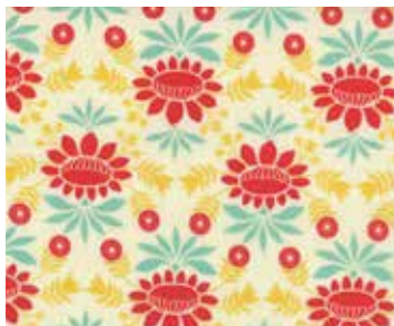
*37062 11 Multi