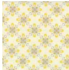
*37063 22 Cream Mustard