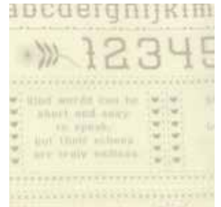
*37061 31 Cream Grey