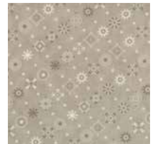
*37064 15 Grey