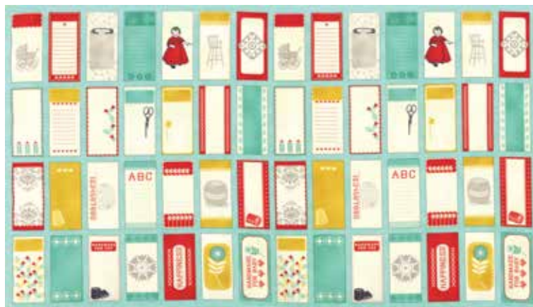
*37060 13 Aqua