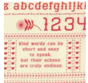
37061 11 Cream Scarlet