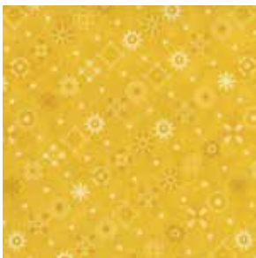
*37064 14 Mustard