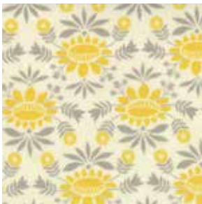
37062 24 Mustard Grey