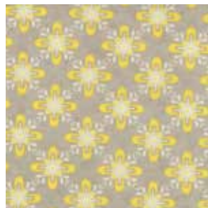
37063 15 Grey