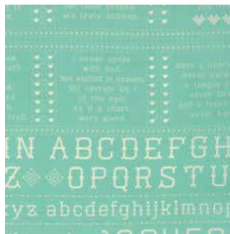
*37061 13 Aqua

Fabrics with * included in low cal assortment