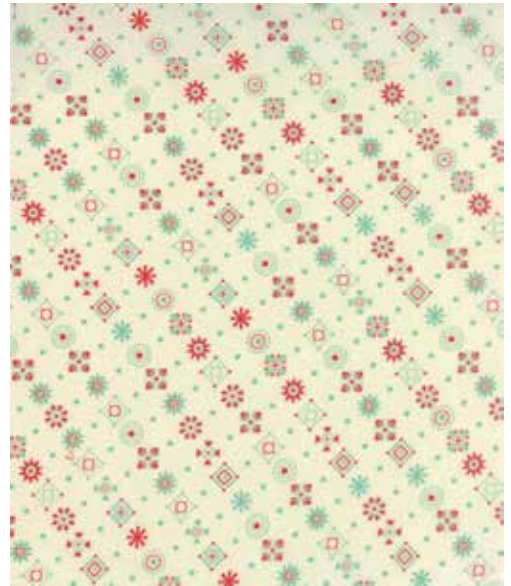
37064 11 Cream Scarlet