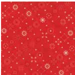
*37064 12 Scarlet