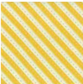
37065 12 Mustard