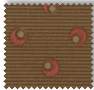
2003 12 Moons Brown