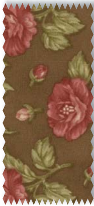
2002 12 Flower Brown