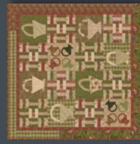
JP 2068 / JP 2068G