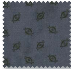
2009 14 OVALS BLUE