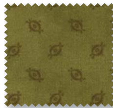
2009 15 OVALS OLIVE