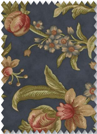
2000 14 LG FLORAL BLUE *Print reduced to show pattern