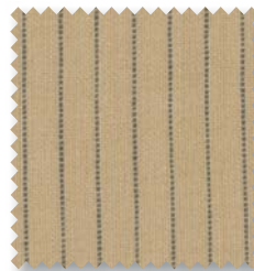
12512 21 BLUE