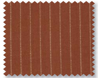
12512 14 RED