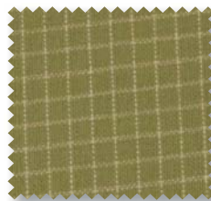
12512 27 OLIVE