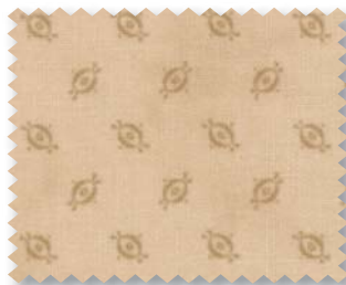
2009 11 OVALS TAN