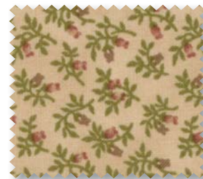
2008 11 BUDS TAN