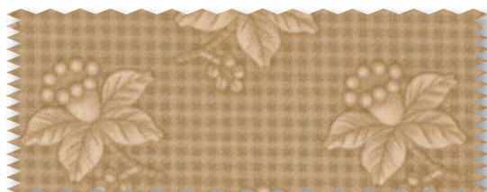
2005 11 DAFFODIL TAN