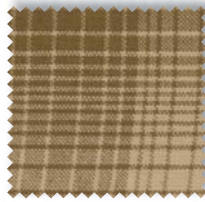
12512 19 Earth Brown