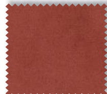
2010 13 Solid Red

Tip: Store liquid and powder detergents in decorative glass jars. Recycle their original containers.