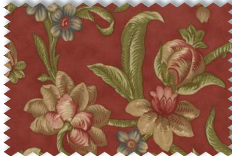
2000 13 Lg Floral Red *Print reduced to show pattern