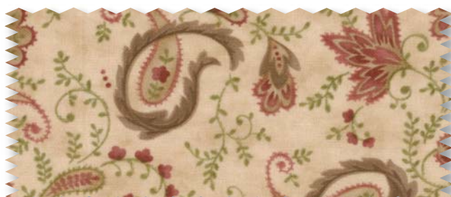
2001 11 PARSLEY TAN