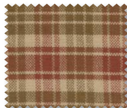
12512 11 RED