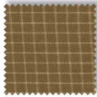
12512 18 Earth Brown