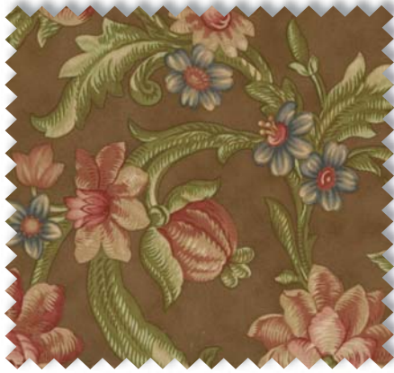
2000 12 Lg Floral Earth Brown *Print reduced to show pattern

Blessed are they that give, blessed are they that receive - especially fabric by Moda. Blessings, the newest fabric line from Brannock and Patek, will have you counting yours! Rich deep colors mingle with fresh, muted tones in florals, paisleys and prints. Get them fast, these fabrics are a blessed event indeed.