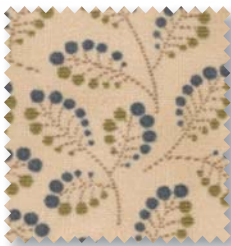
2007 14 LEAVES BLUE