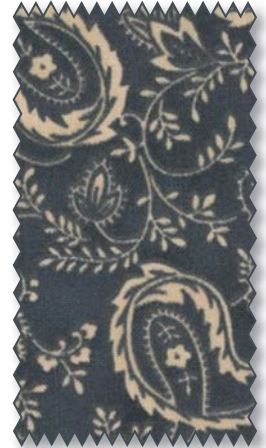
2001 24 PARSLEY BLUE TAN