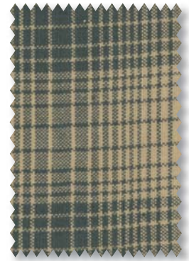
12512 22 BLUE