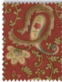
2001 13 Paisley Red

Tip: Store liquid and powder detergents in decorative glass jars. Recycle their original containers.