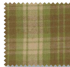
12512 28 OLIVE