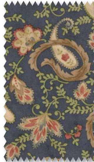
2001 14 PARSLEY BLUE