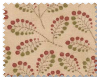
2007 11 LEAVES TAN