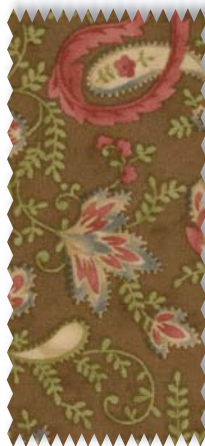
2001 12 Paisley Brown