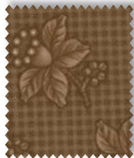
2005 12 Daffodil Brown