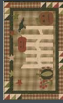
JP 2060 / JP 2060G