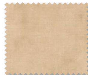
2010 11 SOLID TAN