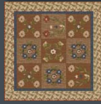
JP 2063 / JP 2063G