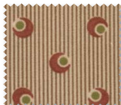
2003 11 MOONS RED