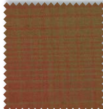
12512 16 Red