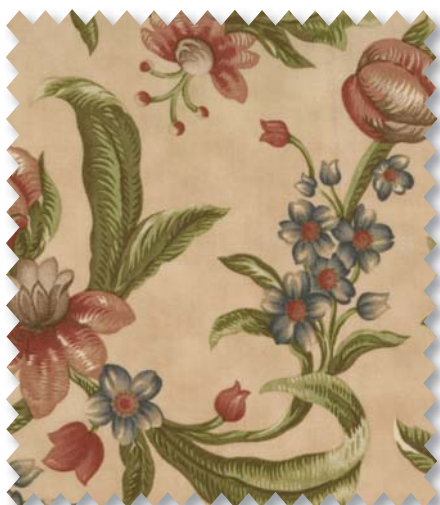
2000 11 LG FLORAL TAN *Print reduced to show pattern