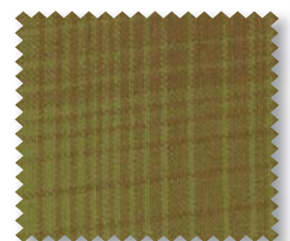
12512 29 OLIVE