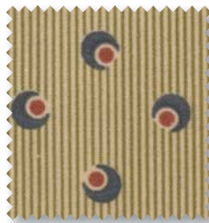
2003 14 MOONS BLUE