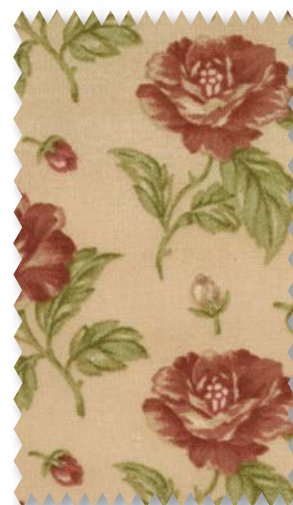
2002 11 FLOWER TAN