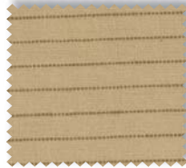
12512 17 Earth Brown