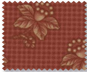
2005 13 DAFFODIL RED