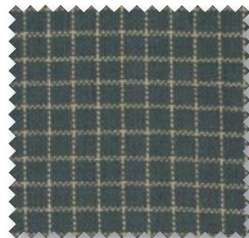
12512 23 BLUE