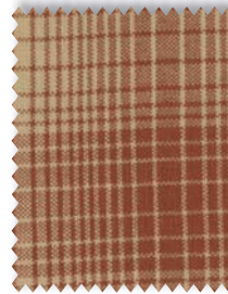
12512 13 Red