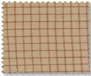
12512 12 RED