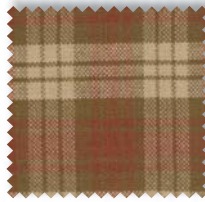
12512 15 Red