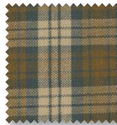
12512 20 BLUE