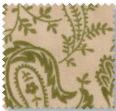
2001 21 PARSLEY OLIVE