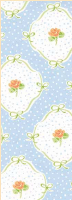
*reduced 65% 31066 15