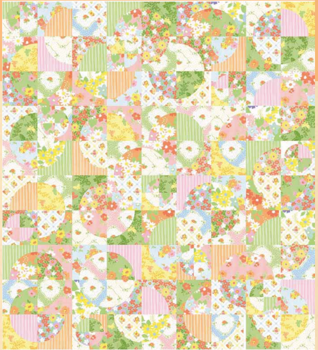
Dream On Quilt — #PS31065 Finished Quilt Measures 63" x 70"