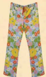
Dream On Lounge Pants 967-57SM sz. small- med. 967-57LXL sz. large-x-large