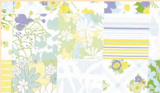
*reduced 70% 31067 16