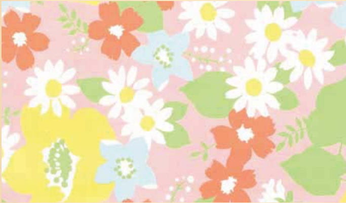
*reduced 65% *31060 11