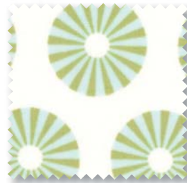
23042 26 CIRCUS DOT IVORY SAGE