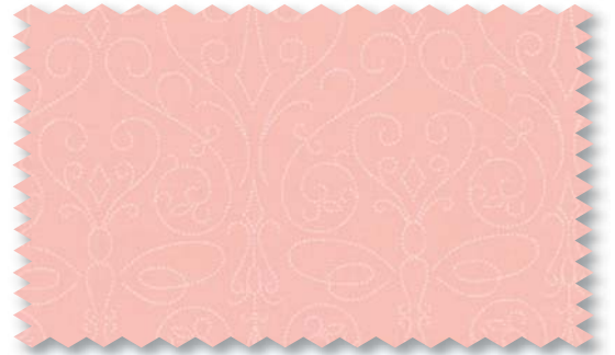
23018 46 DRAGONFLY PINK