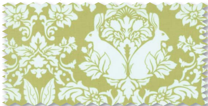
quilted 23006 43 BUNNY DAMASK SAGE AQUA *Print reduced to show pattern