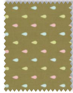
23002 49 DROPLETS BROWN