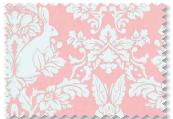
23006 41 BUNNY DAMASK PINK *Print reduced to show pattern