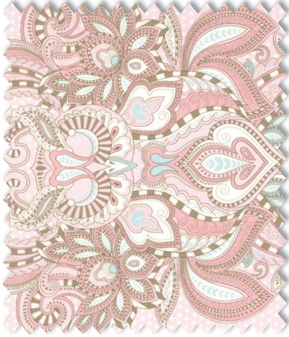
23040 15 OWL STRIPE PINK *Print reduced to show pattern