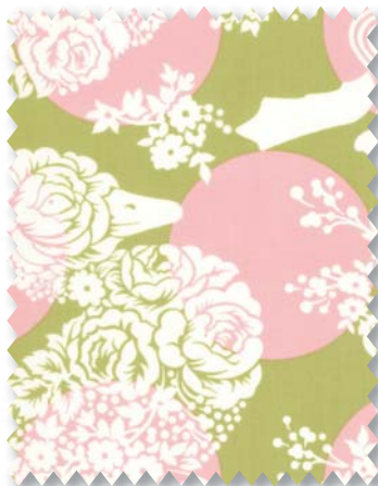
23041 12 DUCKY DOT SAGE *Print reduced to show pattern