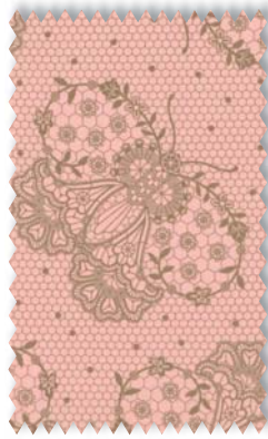
23013 44 BUTTERFLY LACE PINK *Print reduced to show pattern