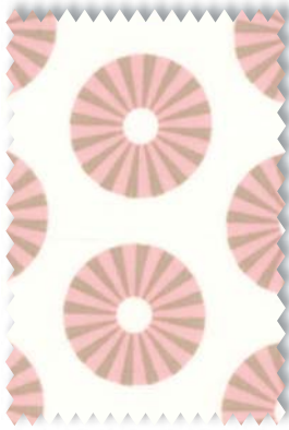
23042 25 CIRCUS DOT IVORY PINK