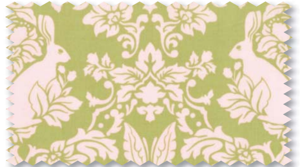
23006 42 BUNNY DAMASK SAGE PINK *Print reduced to show pattern

TIP: Find detergents which contain Carezyme ® , which keeps fabrics looking new longer.