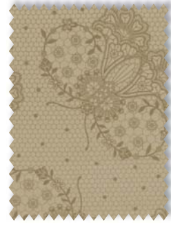
23013 49 BUTTERFLY LACE BROWN *Print reduced to show pattern