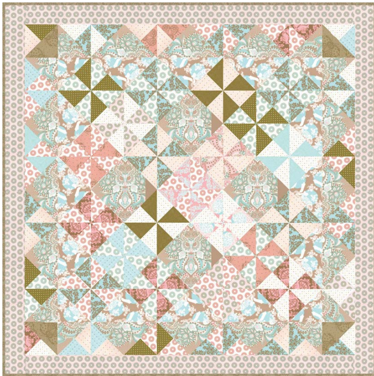
#KIT23040 KIT #TP 500/ #TP 500G PATTERN HUSHABYE QUILT MADE BY JEN McCLEAN QUILT MEASURES 60"X 60"