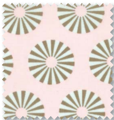
23042 11 CIRCUS DOT PINK