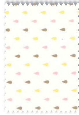
23002 41 DROPLETS IVORY PINK