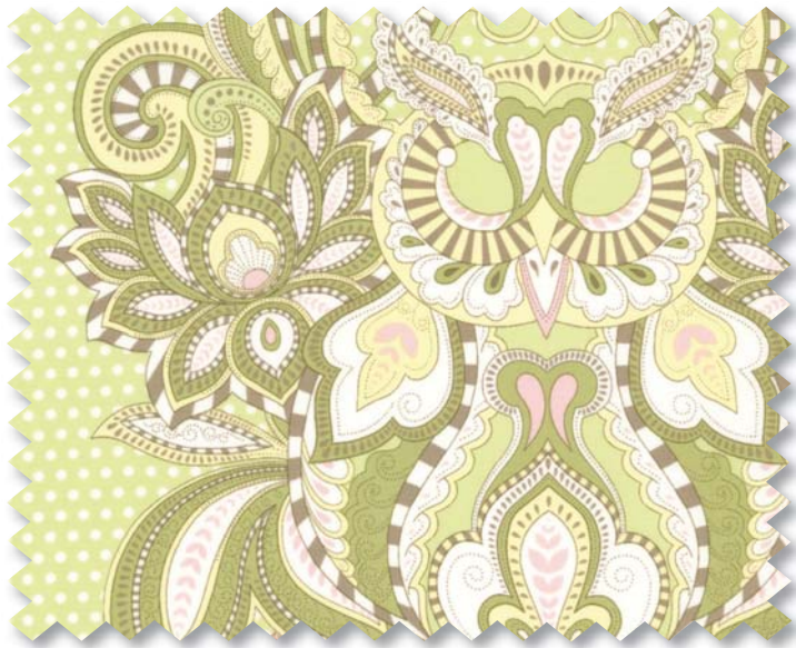
23040 12 OWL STRIPE SAGE *Print reduced to show pattern