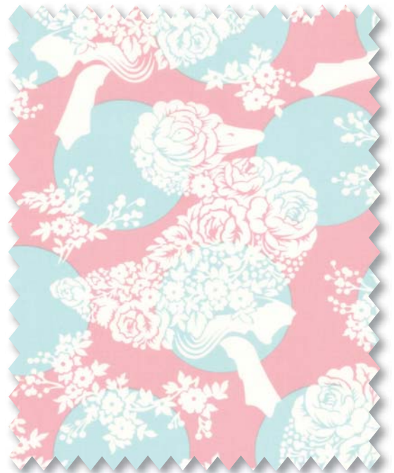
23041 11 DUCKY DOT PINK *Print reduced to show pattern