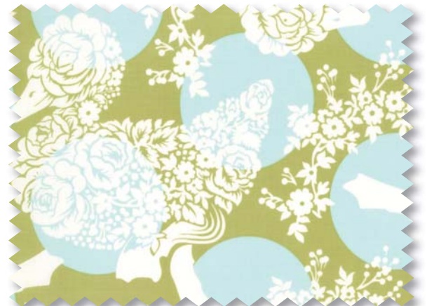
23041 13 DUCKY DOT AQUA *Print reduced to show pattern