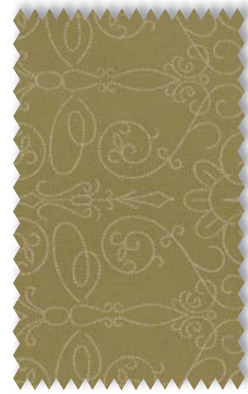
23018 41 DRAGONFLY BROWN