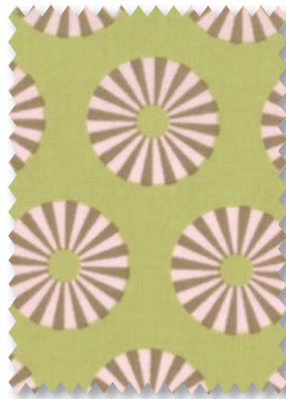
23042 12 CIRCUS DOT SAGE