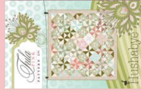
TP 500 TP 500G

A little bit of sweet and a whole lot of sass. Hushabye toes the line between baby chic and swanky sophistication. A dash of color and a bit of kick give this collection all the sugar and spice that cotton can hold. Let these candy colored owls and candy colored ovals and confectionery chicks lull you into sweet satisfaction.