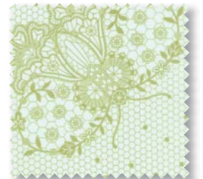
23013 42 BUTTERFLY LACE AQUA *Print reduced to show pattern