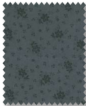
14511 35 STAR FLOWER NAVY