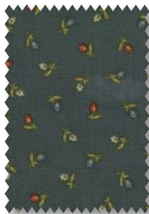
14525 25 FLORAL CHECK NAVY