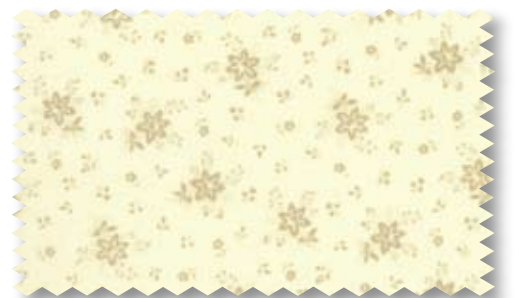
14511 31 STAR FLOWER IVORY