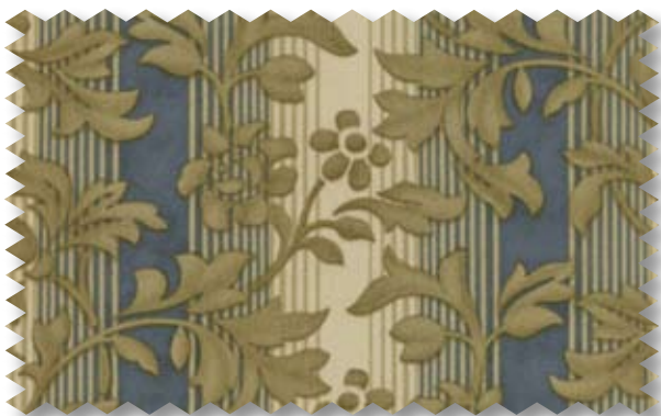
14641 15 FLORAL STRIPE NAVY