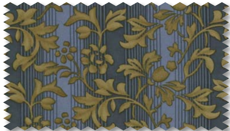
14641 16 FLORAL STRIPE BLUE