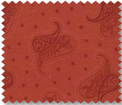
14645 24 TOSSED PAISLEY RED

TIP: Use heavy cotton or outdoor fabric for a closepin bag. The bag will stand up to the elements and last longer.