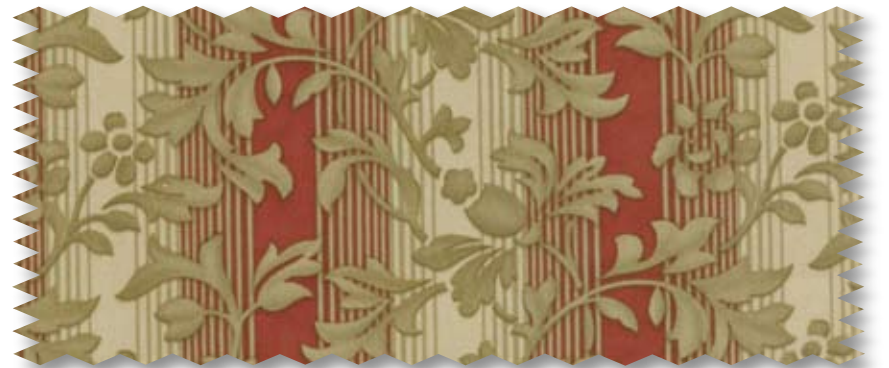
14641 13 FLORAL STRIPE RED