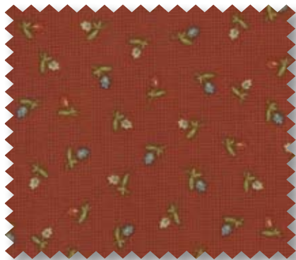
14525 23 FLORAL CHECK RED

TIP: Use heavy cotton or outdoor fabric for a closepin bag. The bag will stand up to the elements and last longer.