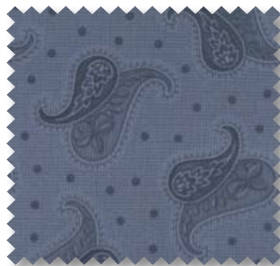
14645 26 TOSSED PAISLEY BLUE