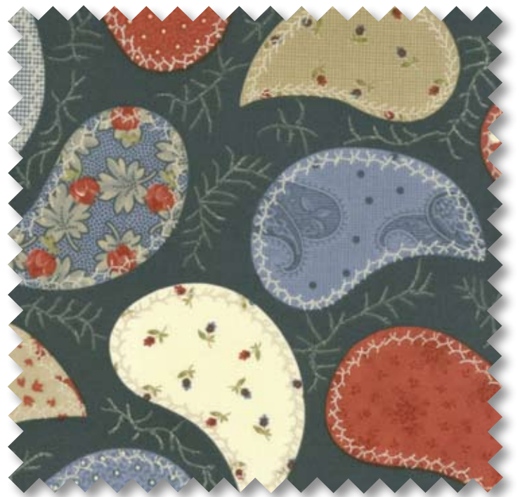
14648 15 CHEATER QUILTS NAVY