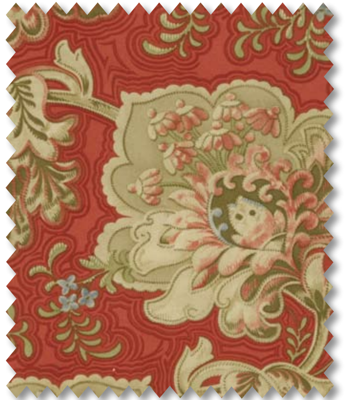
14640 14 MAIN STREET RED