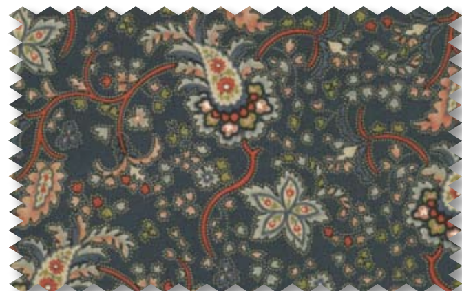
14642 15 MORNING GLORY NAVY