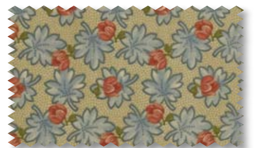
14646 12 SMALL FLOWER SAND