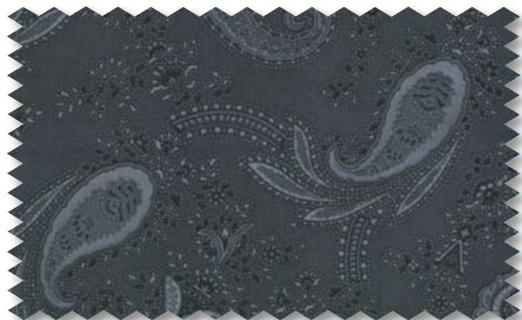
14643 15 PAISLEY NAVY