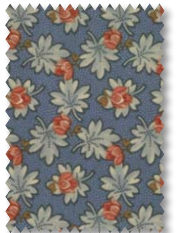
14646 16 SMALL FLOWER BLUE