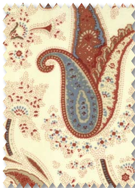
14643 11 PAISLEY IVORY