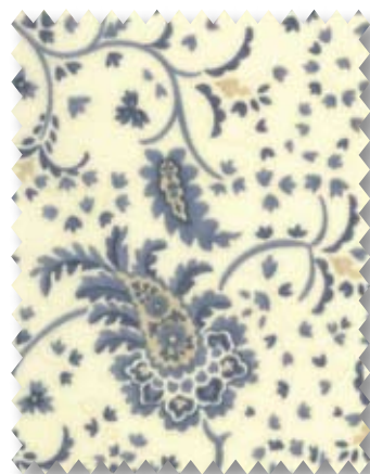
14642 11 MORNING GLORY IVORY