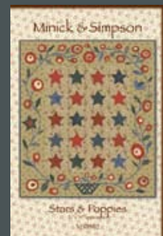
MS 0902/ MS 0902G

Wiscasset, Maine, known as "Maine's Prettiest Town", is the inspiration for the new fabric collection from Minick and Simpson. This seaport town with a rich history of commerce is a treasure trove of antiques from all over the world. "Wiscasset" - from the Native American Abenaki tribe - means "coming out of the harbor to trade." Today, Wiscasset is a flourishing hub of antique shops and dealers.