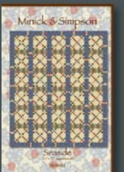
MS 0901/ MS 0901G