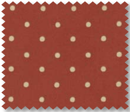
14647 13 POLKA DOTS RED