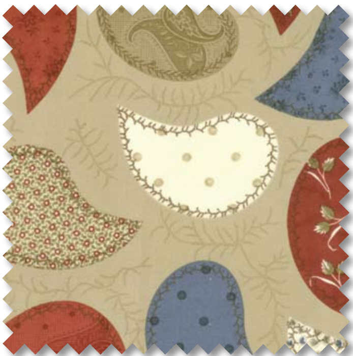
14648 12 CHEATER QUILTS SAND