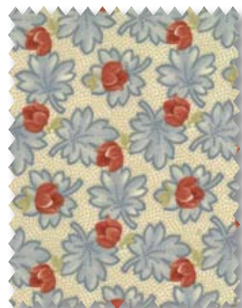
14646 11 SMALL FLOWER IVORY