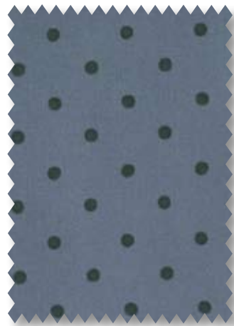
14647 16 POLKA DOTS BLUE