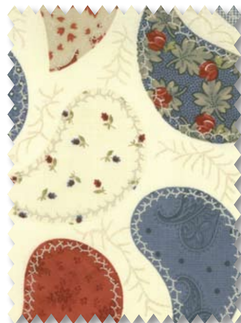
14648 11 CHEATER QUILTS IVORY