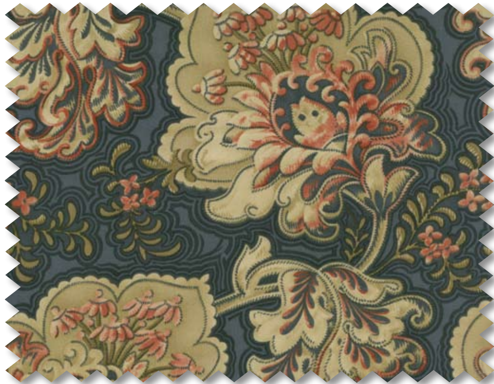
14640 15 MAIN STREET NAVY