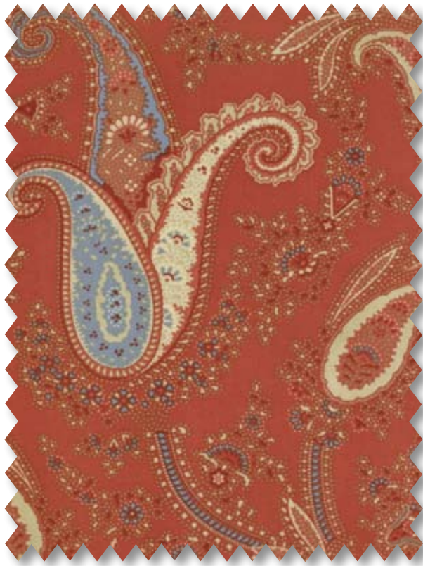
14643 14 PAISLEY RED