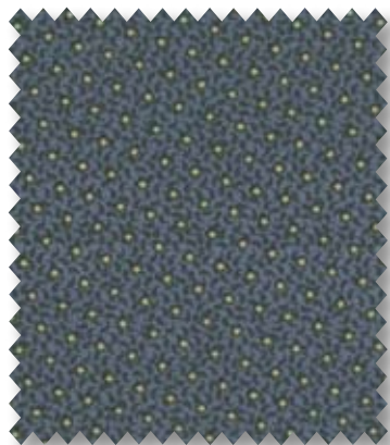
14512 26 CALICO BLUE