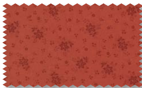
14511 34 STAR FLOWER RED