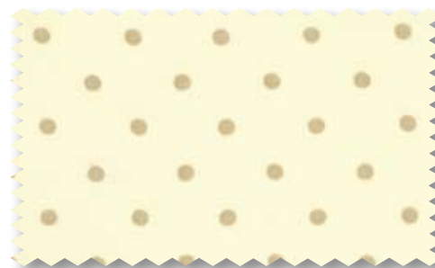
14647 11 POLKA DOTS SAND