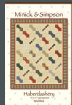
MS 0904/ MS 0904G