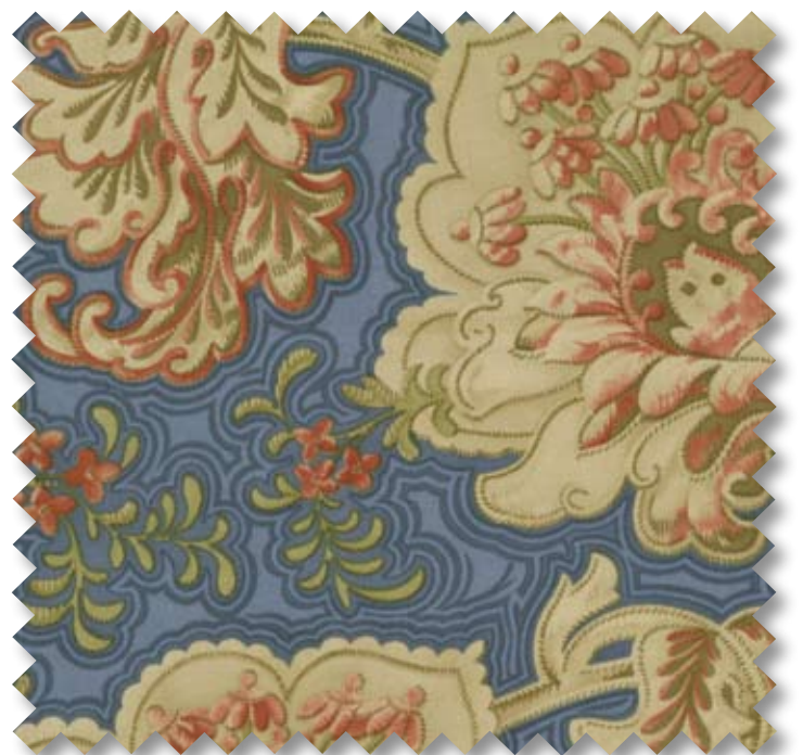
14640 16 MAIN STREET BLUE