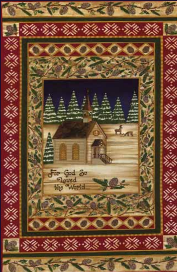
Fabric #1 – Panel