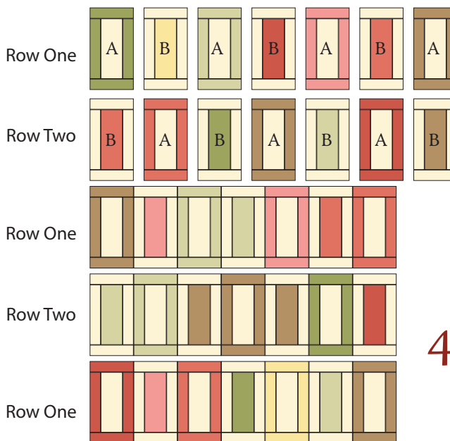
56½" x 70½" with seams

3 Two rows make up the quilt top. Starting with Block A, alternately sew 4 Block As and 3 Block Bs to make Row One. Press away from Block B. Make 3. Press away from Block B. Starting with Block B, alternately sew 4 Block Bs and 3 Block As to make Row Two. Make 2. Join the rows.