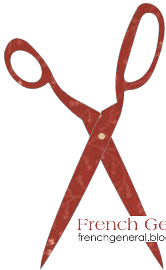
French General frenchgeneral.blogspot.com