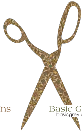
Basic Grey basicgrey.com