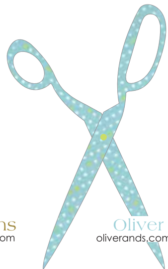
Oliver + S oliverands.com/blog

Did you answer EVERYTHING!?! www.modafabrics.com