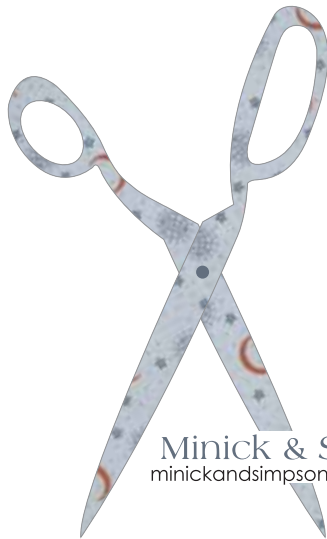
Minick & Simpson minickandsimpson.blogspot.com