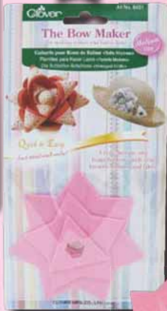
Bow Maker Medium Stock# 8451