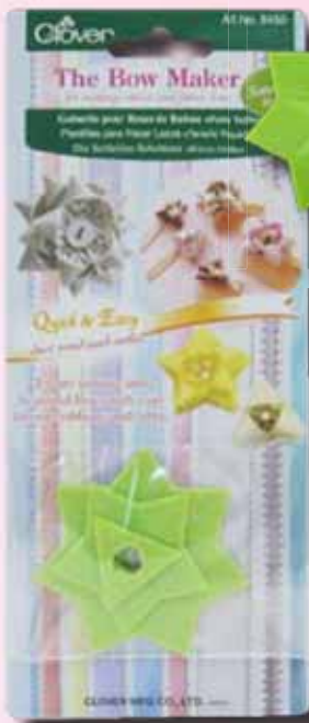
Bow Maker Small Stock# 8450

Simply wind a ribbon around the reusable plate to create a unique bow! Combine various fabrics and beads to create your own designs. Satin, organdy, grosgrain - the possibilities are endless. Quick and easy! Includes three plates to make 3 types of bows, Triangle, 5-Point Star and 7-Point Star.