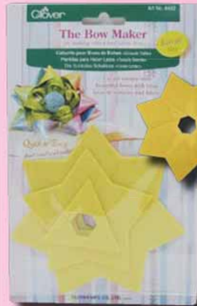
Bow Maker Large Stock# 8452