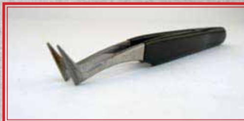
Stock # PT-05

Absolutely the best tweezers you'll ever find! Use for quilting, sewing, machine embroidery, scrapbooking and many other hobbies. Designed to work with the Curve Master.