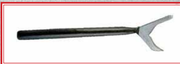
Stock # SM-07

Sew Mate All Purpose Tool Like a stiletto, this multi-purpose tool pushes, pulls, holds, rips, tugs, lifts, guides and protects fingers from your needle and iron.