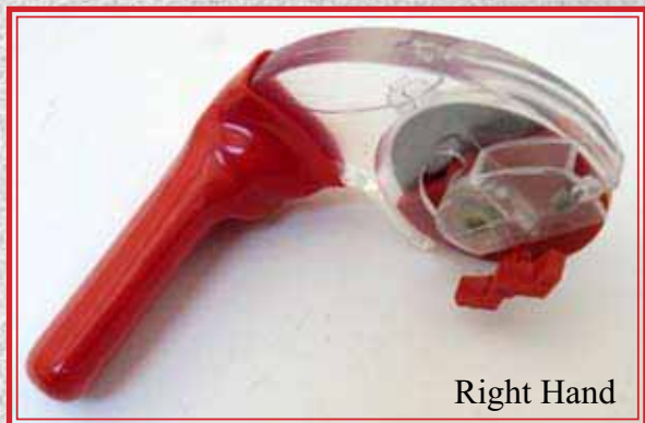
Ergo Rotary Cutter 45mm Stock # EC-45-RH

Problems with arthritis, carpal tunnel syndrome, tendonitis, hand fatigue, neck or arm pain? Unlike traditional rotary cutters, the Ergo Cutter is held in a natural position with your arm and hand evenly distributing all of the pressure. Cuts round, scalloped or patterned shapes. Safe, automatic springloaded guard closes with a flip of a finger.