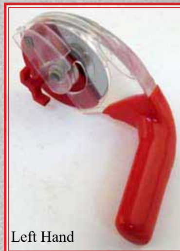
Ergo Rotary Cutter 45mm Left Hand Stock # EC-45-LH