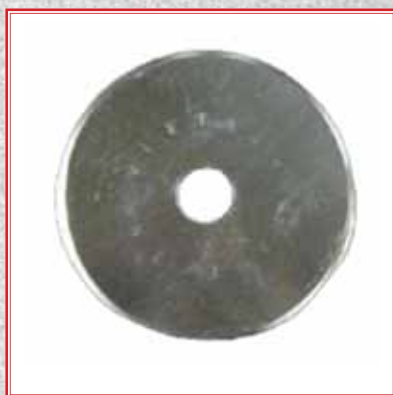
Ergo Replacement Blade 45mm Stock # RB-45-01