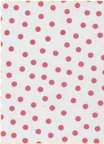
Polka Dots Pink Stock # POK-PINK