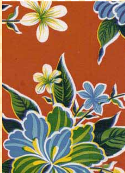
Hibiscus Red Stock # H-RED