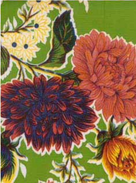
Mums Green Stock # M-GREEN