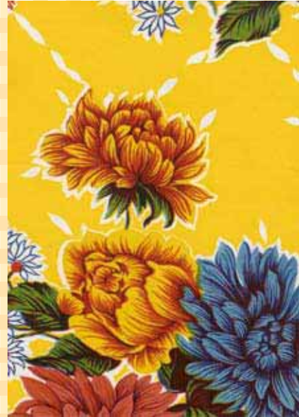
Mums Yellow Stock # M-YELLOW