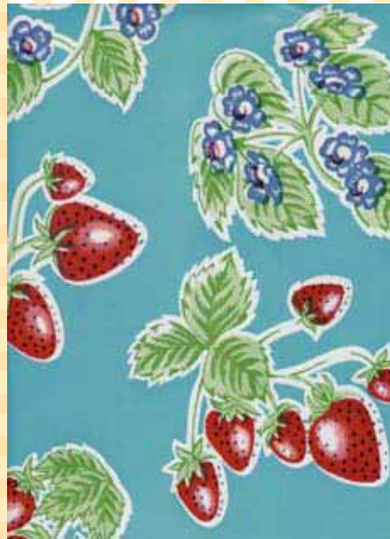
Forever Sky Blue Stock # FO-SKYBLUE