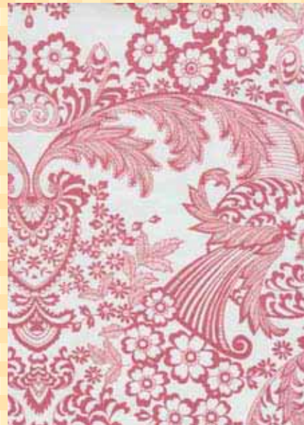
Paradise Lace Pnk Stock # P-PINK