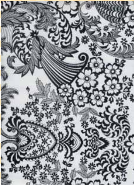
Paradise Lace Black Stock # P-BLACK