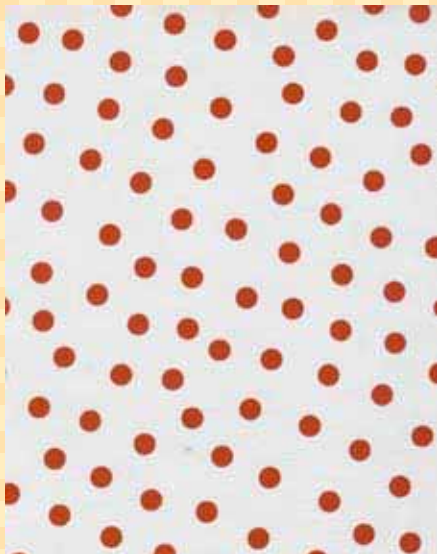
Polka Dots Red Stock # POK- RED