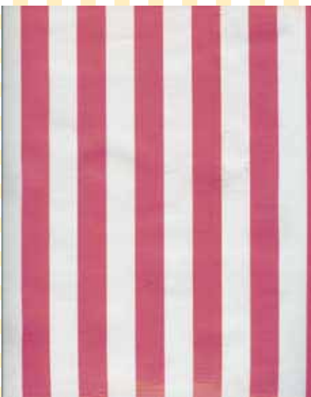
Stripes Pink Stock # SP-PINK