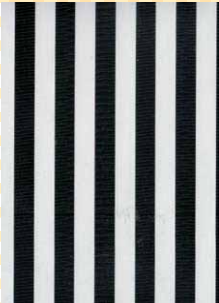
Stripes Black Stock # SP-BLACK