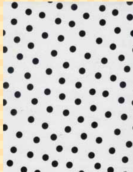
Polka Dots Black Stock # POK-BLACK