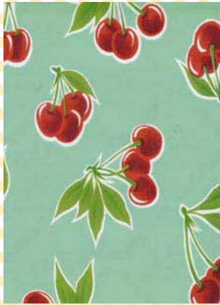
Stella Aqua Stock # ST-AQUA