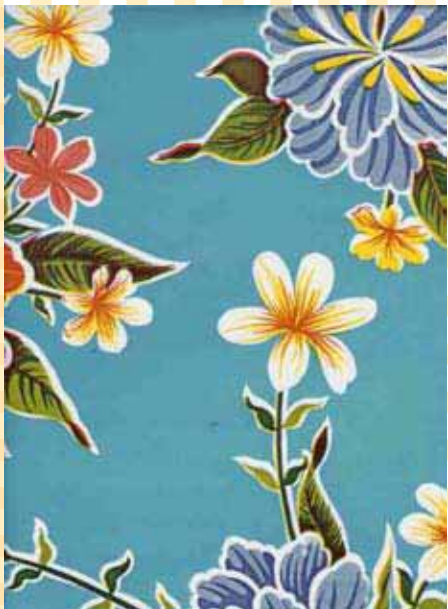
Hibiscus Light Blue Stock # H-LTBLUE