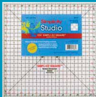
Simpli Ez Square 12.5" x 12.5" Stock # 8829405