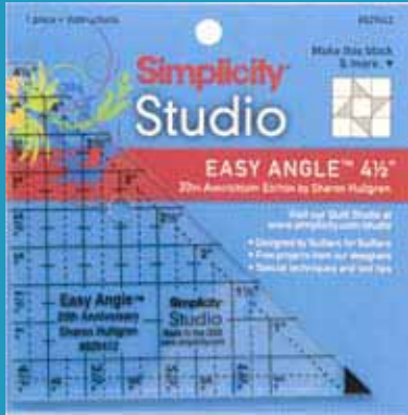
Simpli Ez Easy Angle 4.5" Stock # 8829412

Cuts half square triangles from 1" to 4½". Built in seam allowance - no math to figure. Cut triangles from straight strips quickly and efficiently.