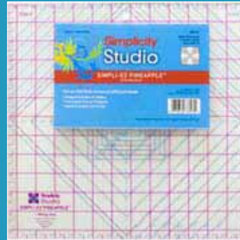
Simpli Ez Pineapple Stock # 8829417

Make Pineapple blocks with no math, no trapezoids, no stress. Make blocks in an almost unlimited range of sizes. Make both traditional and non-traditional Pineapple blocks. Makes log cabin, album style and many other quilt blocks quickly and easily.