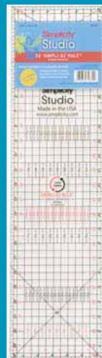
Simpli Ez Ruler 6.5" x 24" Stock # 8829404