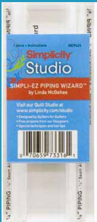
Simpli Ez Piping Wizard Stock # 8829424

Cut perfect seam allowances after covering piping cord. Use with multiple sizes of cording and seam allowance. Always a perfect seam allowance. After making the cording trim the seam allowance to the perfect 1/4" or 1/2". Great for working with piping for quilts, garments and craft projects.