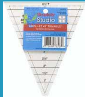
Simpli Ez 45 Degree Triangle Stock # 8829421

Great for use with Kaleidoscope quilts. Many sizes on one tool.