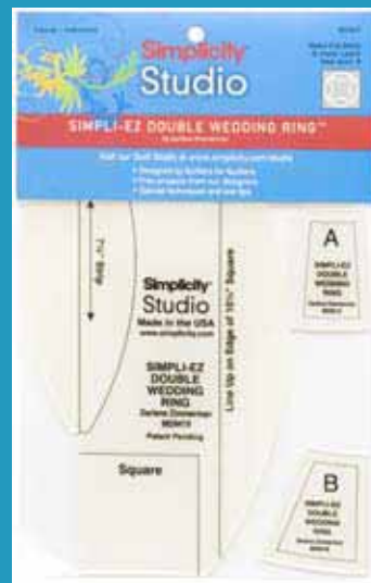
Simpli Ez Double Wedding Ring Stock # 8829419

Cut three different units with one tool - centers, melons, and squares. Inside curves are cut easily as outside curves. A and B units can be cut from strips or squares.