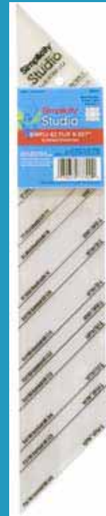
Simpli Ez Flip N Set Stock # 8829414

Cut triangles to setting blocks on point. Folds open to cut triangles for 4" to 16" blocks. No math to figure. Also use to square corners on quilts.