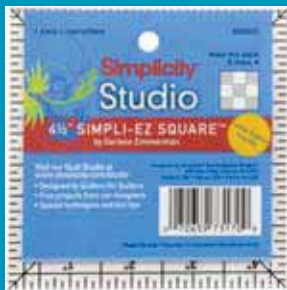
Simpli Ez Square 4.5" x 4.5" Stock # 8828001

Marked in black for right handed users and red for left handed users. Numbers read correctly ANY way the ruler is turned. 1/8" and 1/4" markings. 45° and 60° markings. Large numbers for easy reading.