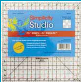
Simpli Ez Square 9.5" x 9.5" Stock # 8829410