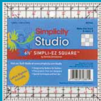
Simpli Ez Square 6.5" x 6.5" Stock # 8829406