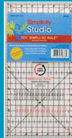
Simpli Ez Ruler 6.5" x 12.5" Stock # 8829403